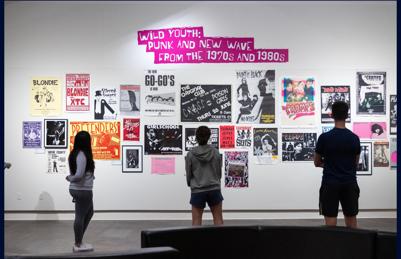
Students look at the “Wild Youth: Punk and New Wave from the 1970s and 1980s” exhibition on display in the William Benton Museum of Art on Sept. 14, 2022. (Sydney Herdle/UConn Photo)